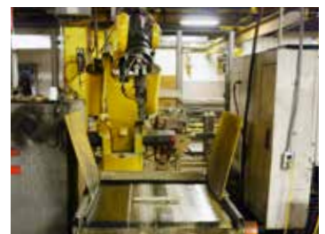
Stem threads and thrust collar is robotically machined and sorted