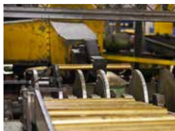
Bar stock is cut to length