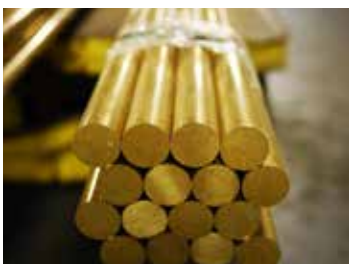
Bronze bar stock