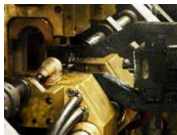
Stem is electrically heated and thrust together to create the thrust collar